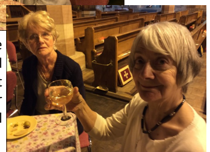
Pictured: Some of the congregation with well-earned refreshment after singing their favourite hymns at All Saints.